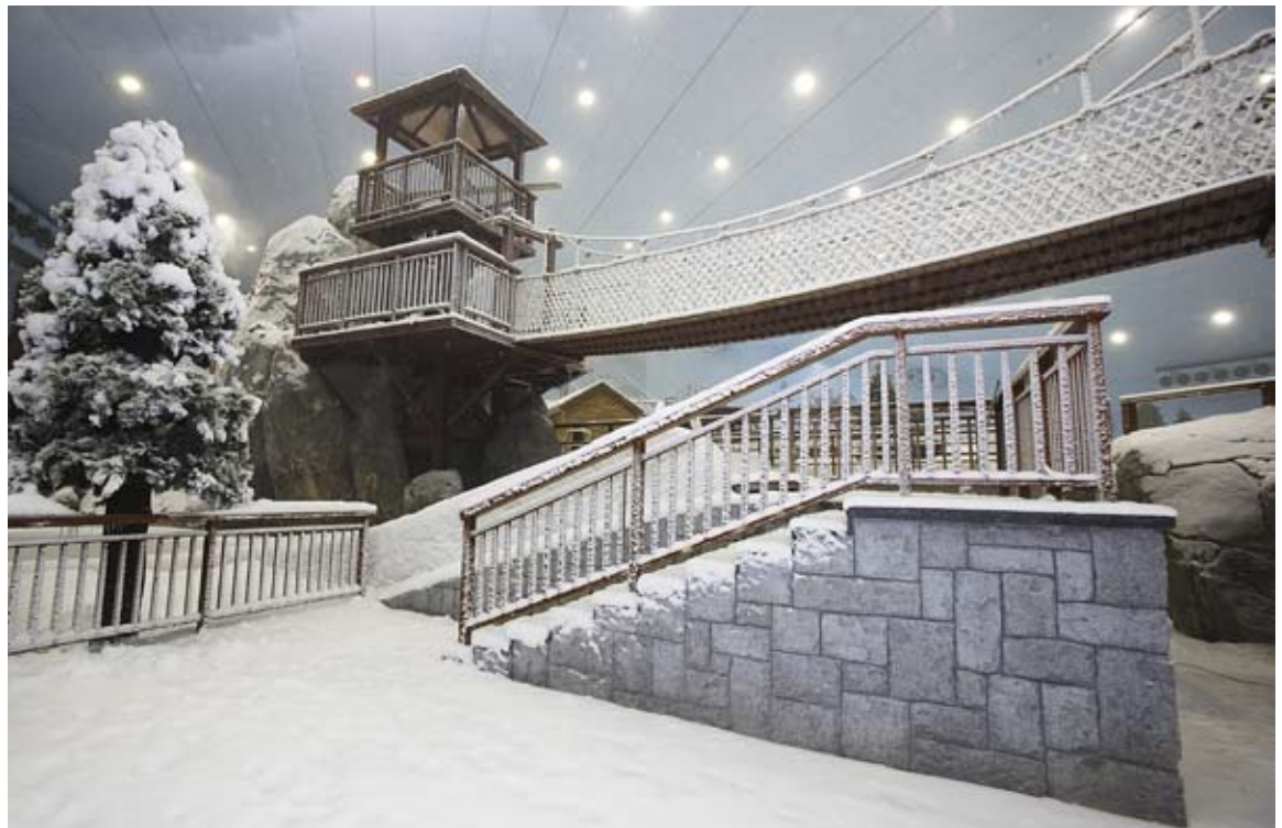
Now you can hit the slopes - in Dubai! Ski Dubai is a winter wonderland in the middle of the desert. Coats, hats and mittens are provided.

The other half of the attraction is the Ice Cave. Enclosed beneath the ski ramp, it makes great use of an otherwise dead area and is kept at