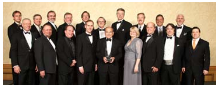
Thea Classic Award - Epcot Team Photo