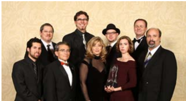
The Air Force One Discovery Center at the Ronald Reagan Presidential Library and Museum Team Photo